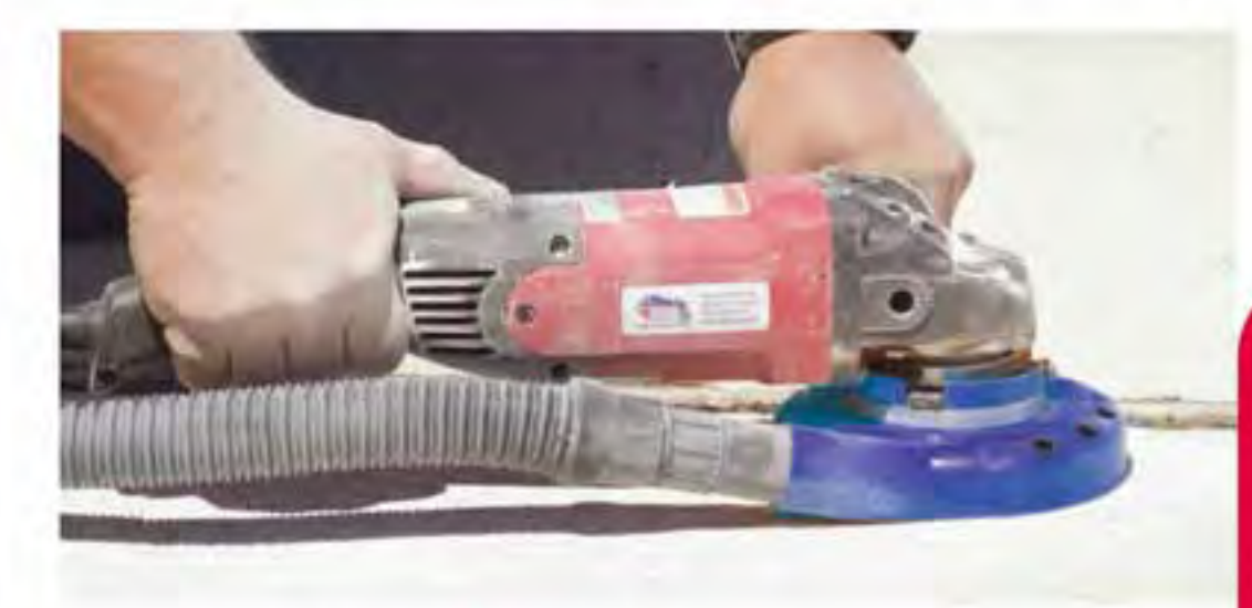
Dust Muzzle With Vacuum